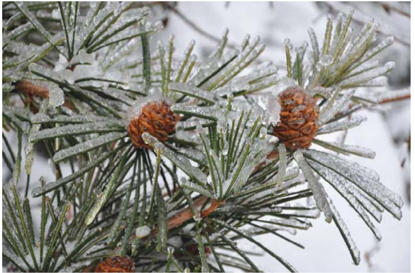
The branches, needles and pinecones of an Umbrella Pine in Duvall carried the weight of ice and snow.