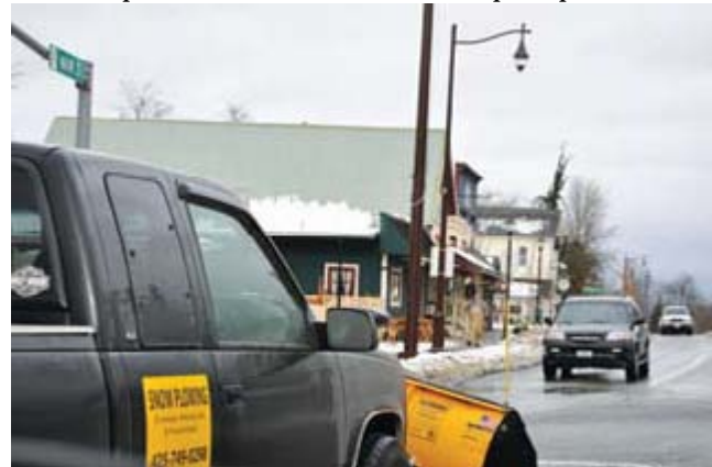
A local, private snowplow company made rounds through downtown Duvall.

Businesses shoveled snow and ice from the sidewalks and, for restaurants like Match, the long power out meant additional cleanup.